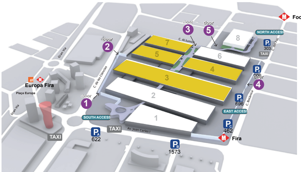
Lorry access to halls 1/7 is through door number 1, 3 or 4 Lorry access to halls 8.0 and 8.1 is through door number 5

Fira Barcelona Gran Via Venue is equipped with several access/exit doors as shown below. Please note that not all doors are accessible at all time, and therefore the venue team will inform you about which door has been allocated for your event.