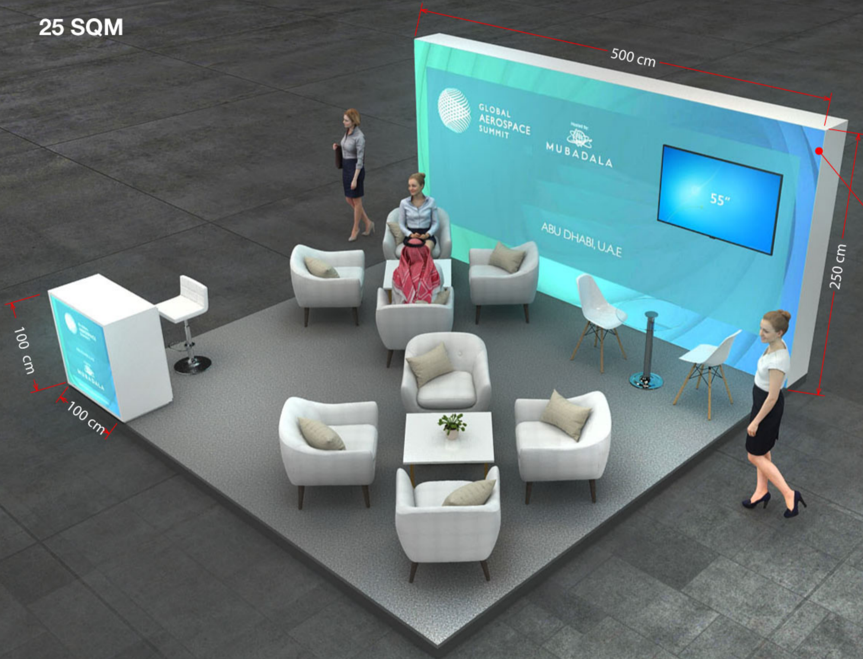
TV Wall Graphic Details