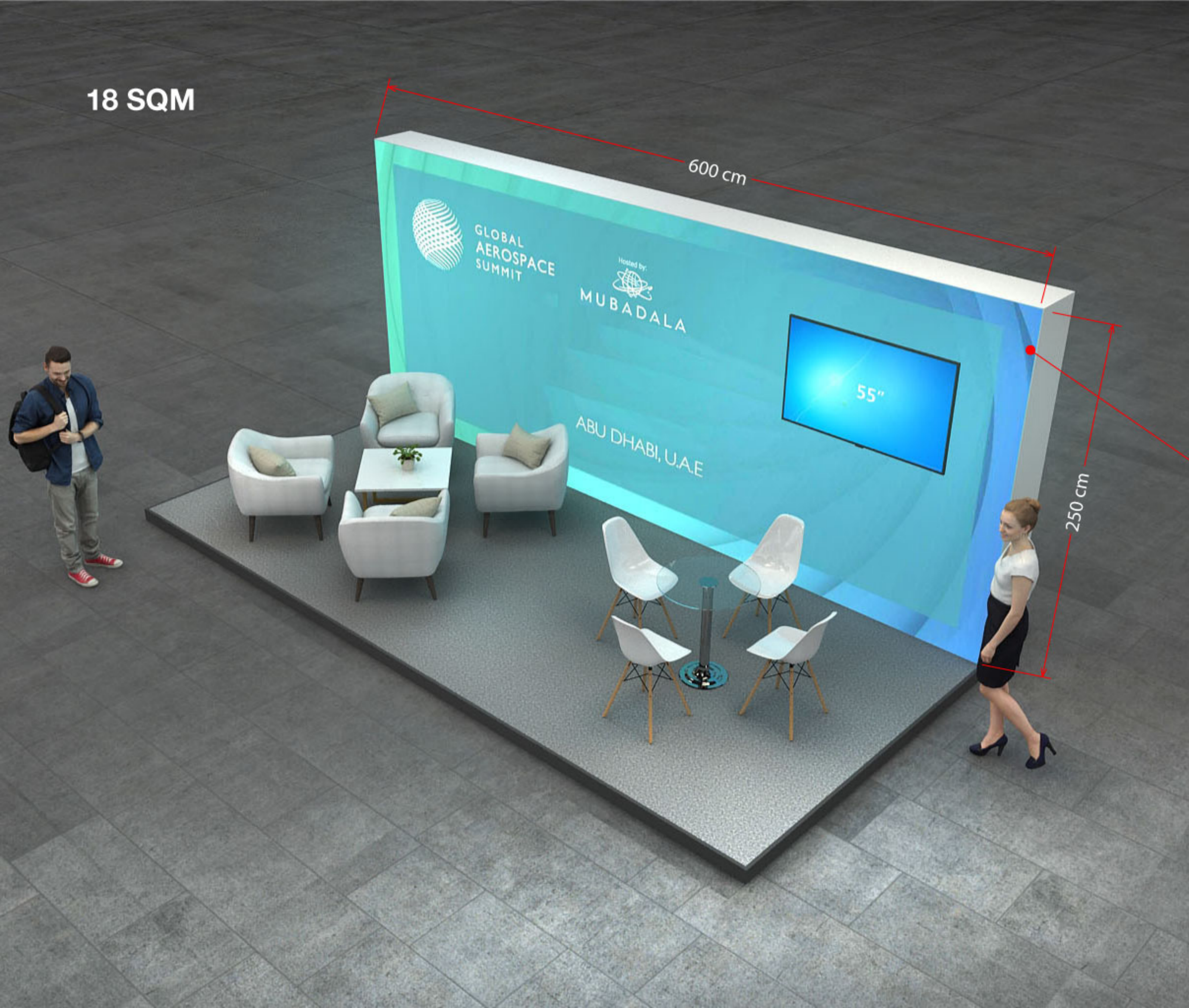
TV Wall Graphic Details