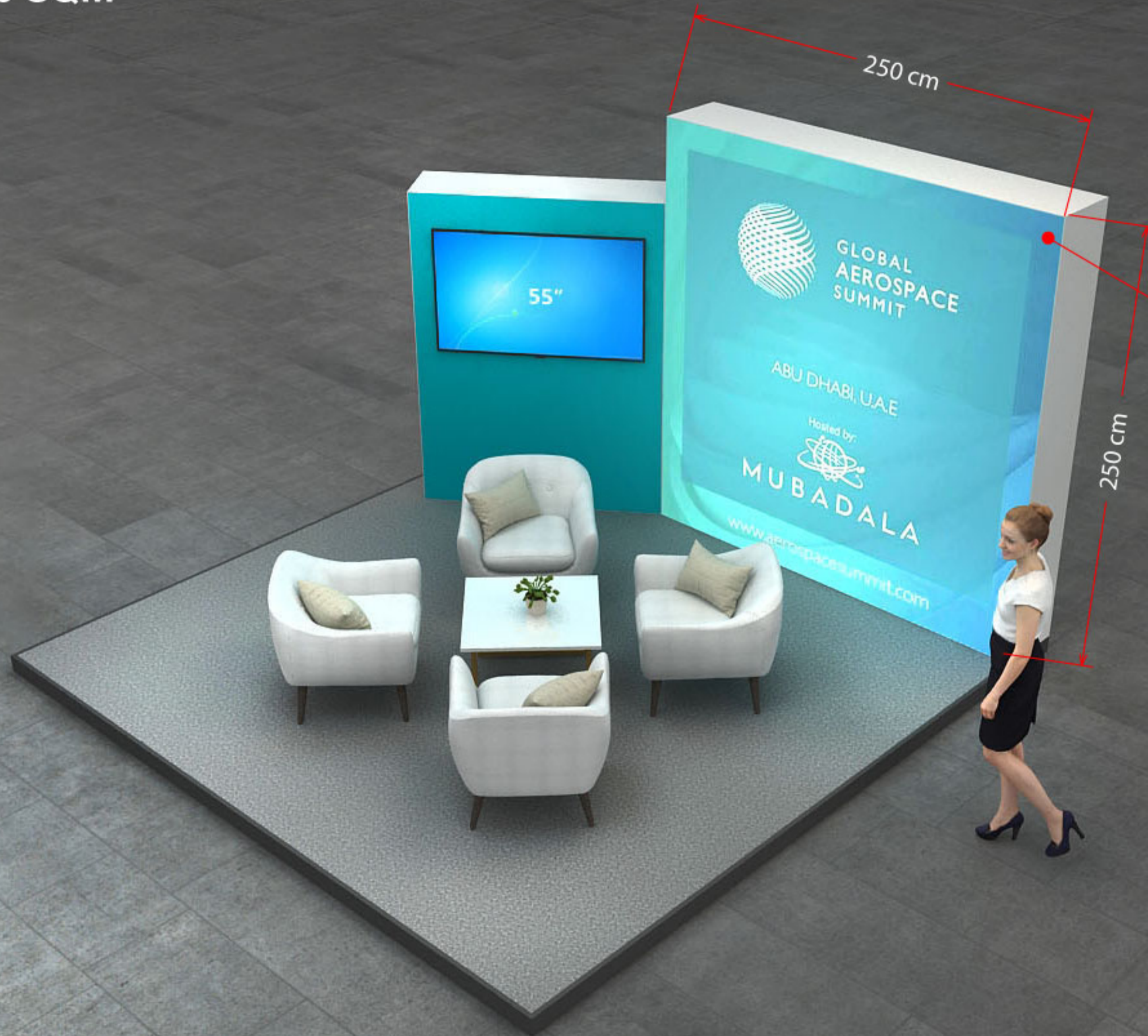
TV Wall Graphic Details