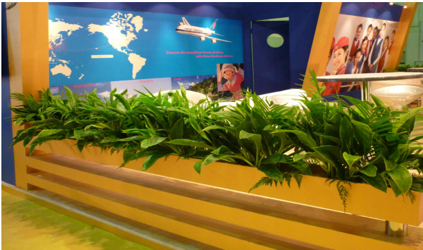
#1 Fresh Cut Leaves Arrangement