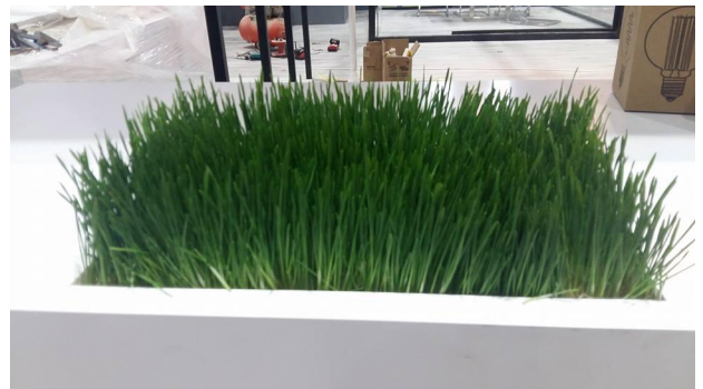
#6 Fresh Wheat Grass Arrangements