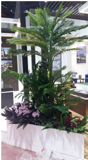
#12 Artificial Palm Tree 2-2.5m