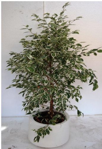
#4 STARLIT SERANADE