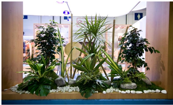
#3 Mixed Fresh plants and cut leaves arrangement