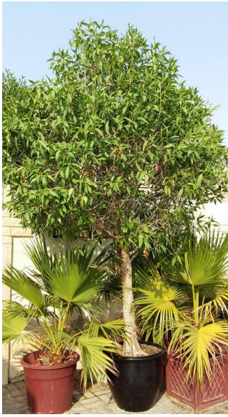
#9 Damas Tree 3m