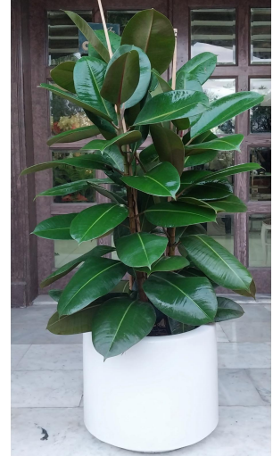
#3 FICUS ROBUSTA