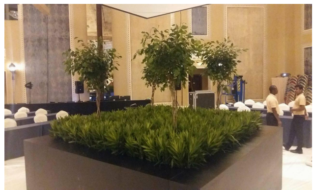
#8 Mixed Cut Leaves Arrangement