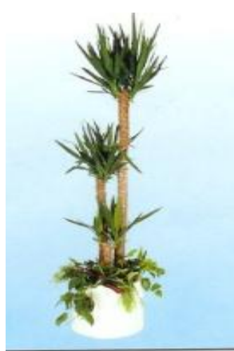
#8 POINT TO THE SKY