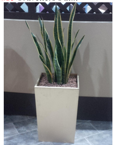
#18 Medium Plinth w/ Sanseveria