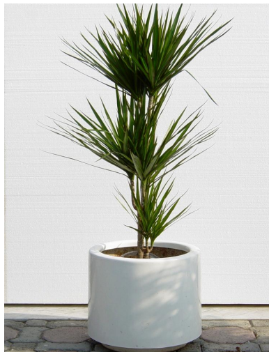
#5 DRAGON CLAW