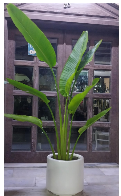
#15 Travellers Palm