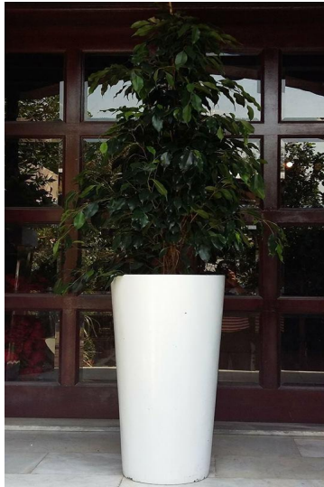
#11 Tall Plinths with Tall Ficus