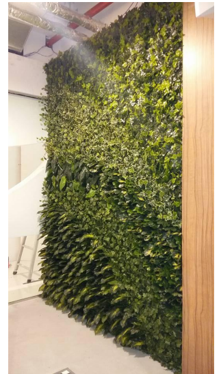
#14 Artificial Green Wall