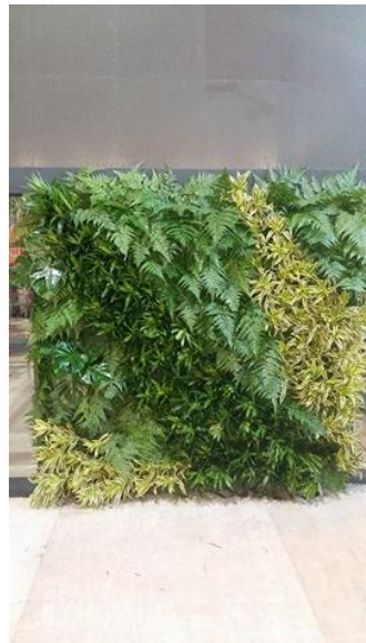
#16 Fresh Cut Leaves/ Moss Wall