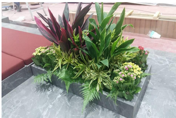
#7 Mixed Cut Leaves Arrangement