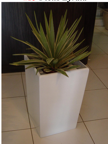
#16 Medium Plinth w/ Silver Aloe