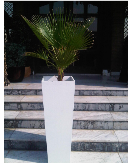
#12 Tall Plinth with Fan Palm