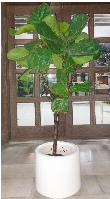
#13 Ficus Lyrata