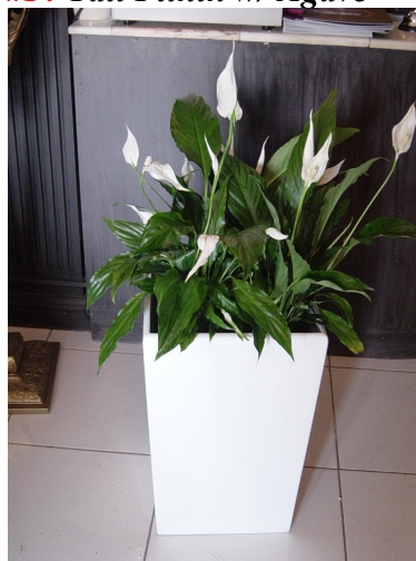
#17 Medium Plinth w/ Sphatiphyllum