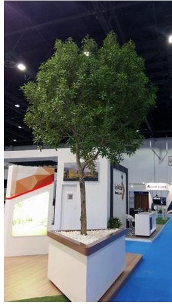
#10 Damas Tree 4m