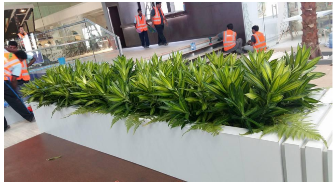
#2 Fresh Cut Leaves Arrangement