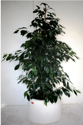
#1 EXOTICA FICUS