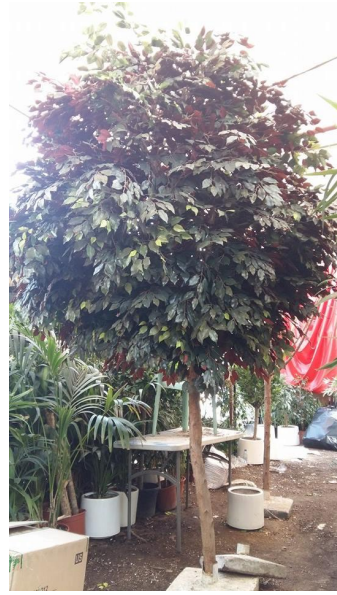
#11 Artificial Tree 2.5m – 4.5m