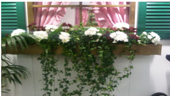
#5 Mixed Fresh Flower and Cut Leaves Arrangement