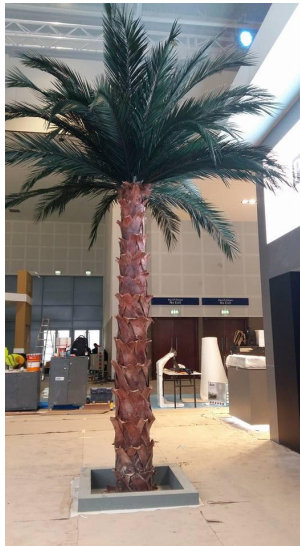
#13 Artificial Palm Tree 3m-5m