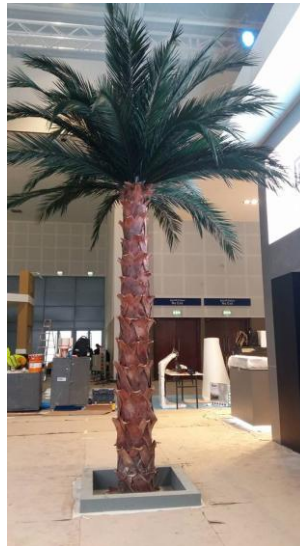
#13 Artificial Palm Tree 3m-5m