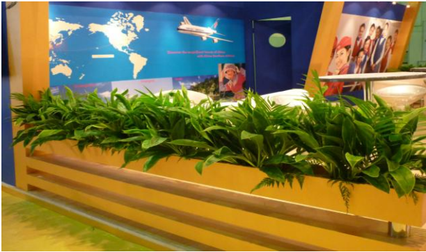
#1 Fresh Cut Leaves Arrangement