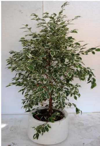
#4 STARLIT SERANADE