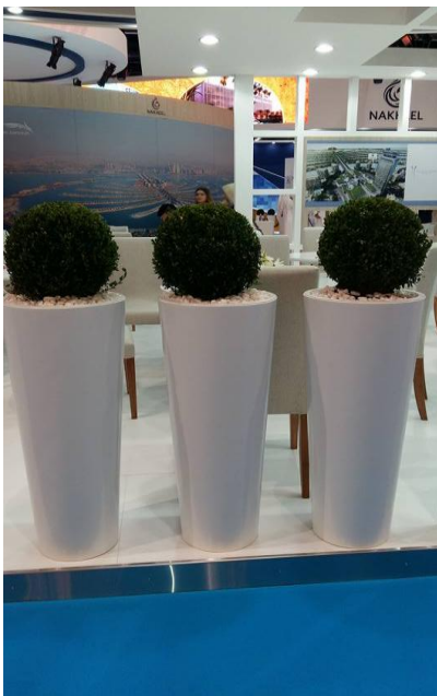
#13 Tall Plinth w/ Round Hedges