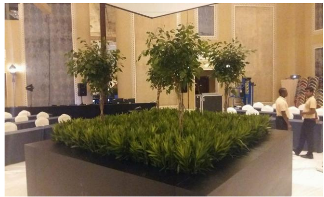
#8 Mixed Cut Leaves Arrangement