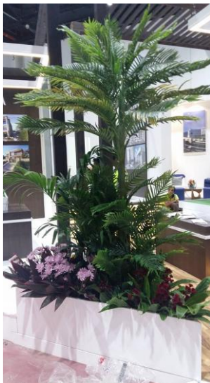
#12 Artificial Palm Tree 2-2.5m