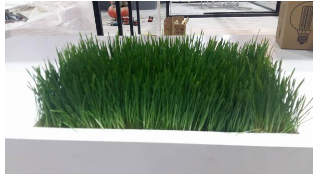
#6 Fresh Wheat Grass Arrangements