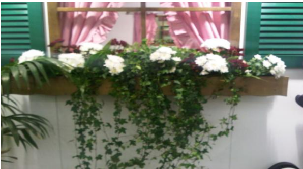
#5 Mixed Fresh Flower and Cut Leaves Arrangement