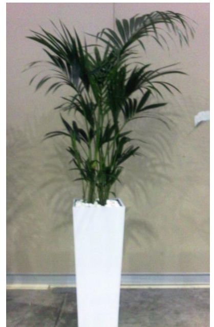
#15 Tall Plinth w/ Kentia Palm