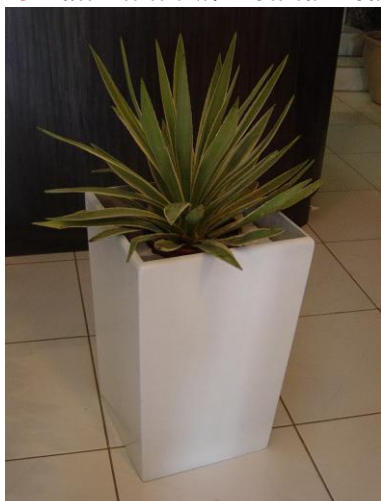
#16 Medium Plinth w/ Silver Aloe