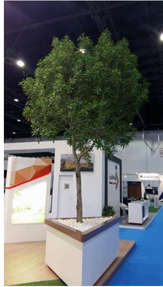
#10 Damas Tree 4m