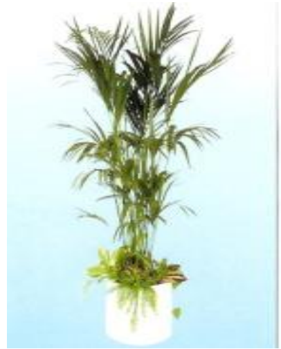
#3 KENTIA / PARADISE FOUND