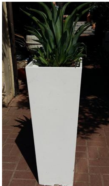
#14 Tall Plinth w/ Agave