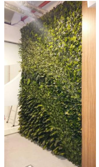
#14 Artificial Green Wall