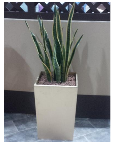
#18 Medium Plinth w/ Sanseveria