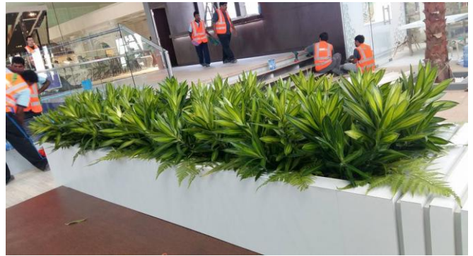
#2 Fresh Cut Leaves Arrangement