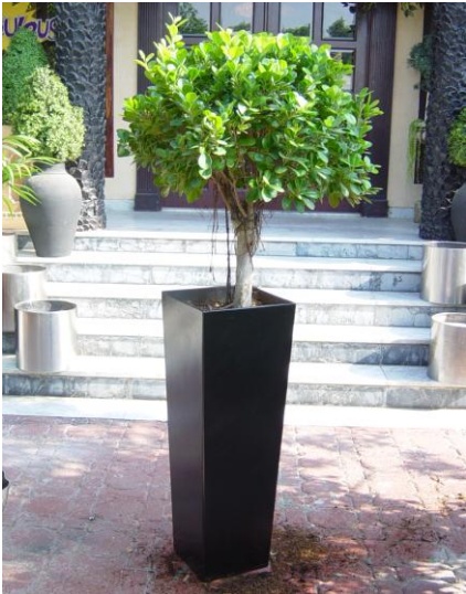
#10 Tall Plinth w/ Round Ficus