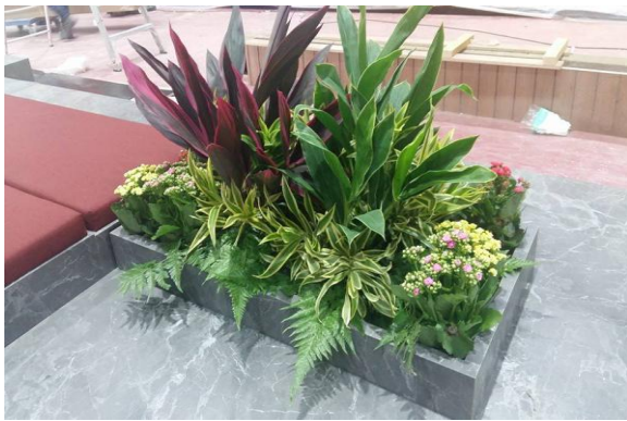
#7 Mixed Cut Leaves Arrangement