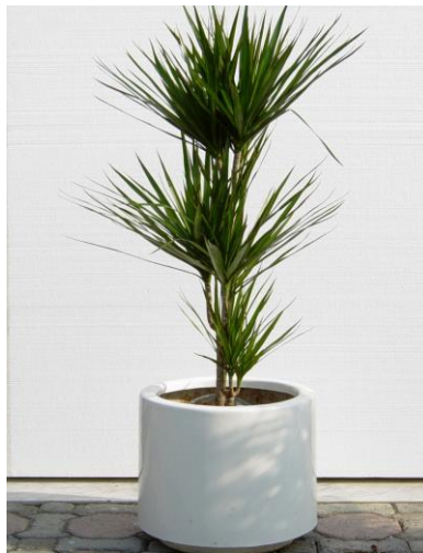
#5 DRAGON CLAW