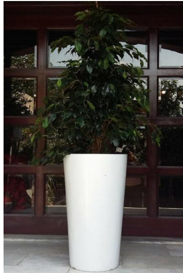
#11 Tall Plinths with Tall Ficus