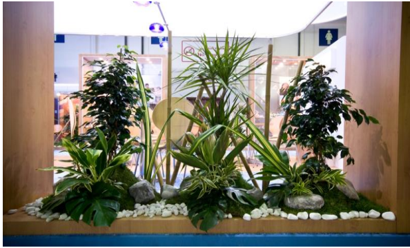
#3 Mixed Fresh plants and cut leaves arrangement