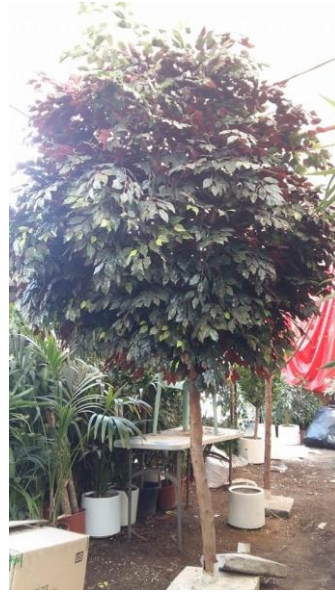
#11 Artificial Tree 2.5m – 4.5m