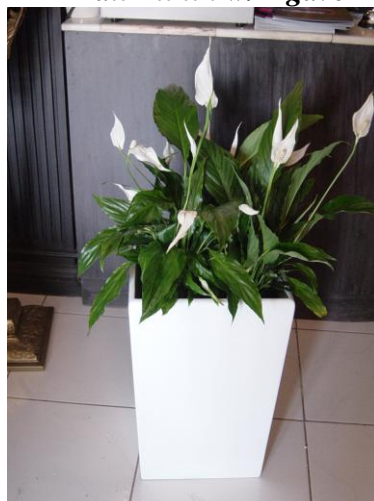
#17 Medium Plinth w/ Spathiphyllum