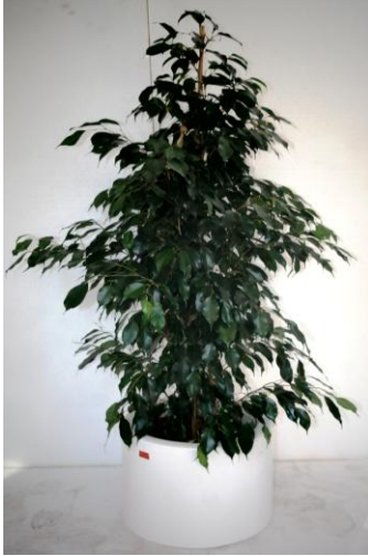
#1 EXOTICA FICUS