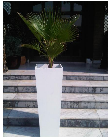
#12 Tall Plinth with Fan Palm