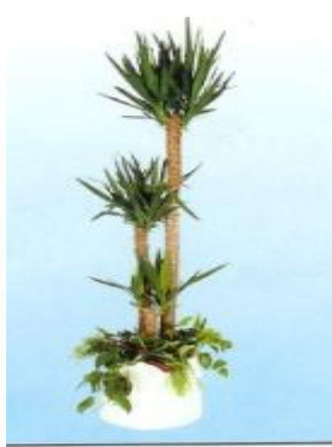
#8 POINT TO THE SKY