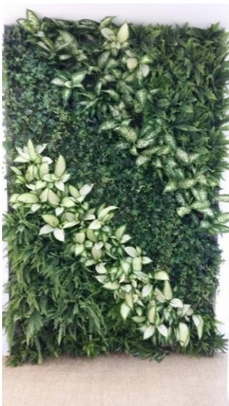
#15 Fresh Plant Vertical Garden