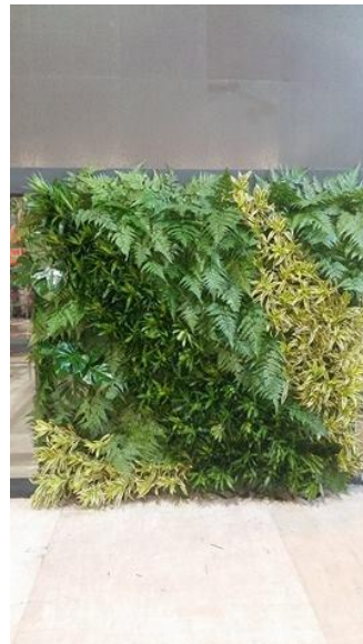
#16 Fresh Cut Leaves/ Moss Wall