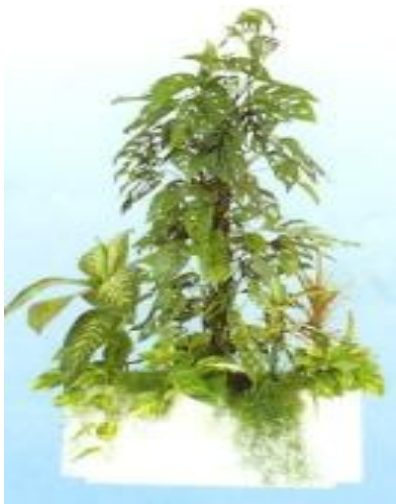
#7 MASTER MIXED