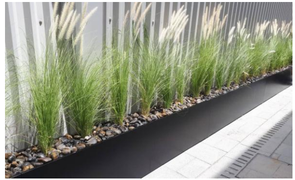
#4 Fresh Grass Arrangement (outdoor)