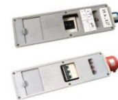
Section D: for Set up & Tear down Breaker 220V Single Phase Breaker 380V Three Phase