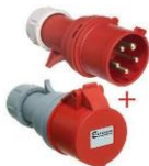
Section B: (For Exhibit) Power Plug (5 Pins) for Breaker Three Phase