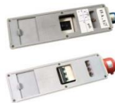
Section B: (For Exhibit) Breaker 220V Single Phase Breaker 380V Three Phase